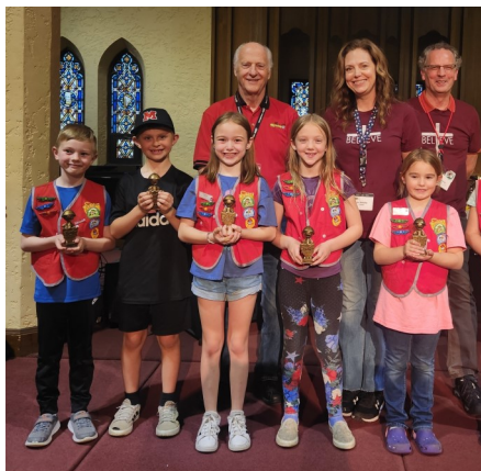
Sparky Award winners and their leaders

Please pray for these children to continue to grow spiritually this summer and for the plans for the 2024-25 Awana year. We can't wait to see what God will do in September through Awana!