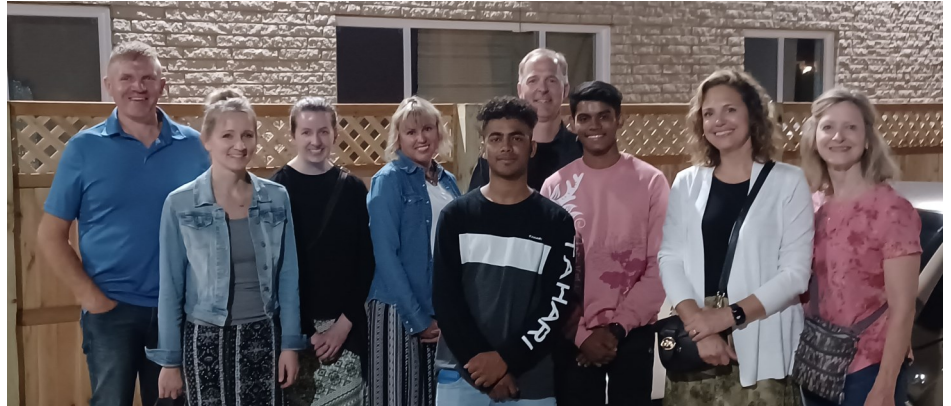
A few of our Milwaukee Rohingya friends with our group

A little while later, the Rohingya woman I saw outside earlier, who was leery of us, came in and sat with us. I think she was in her early 30's. She mostly had her head down, tilted off to the side, and occasionally stole glances of us. While conversation continued around her, I was able to catch her eye at one point and we exchanged gentle smiles. The depth of hurt I saw in this woman's eyes and her overall countenance made my heart break. I may be wrong, I hope I'm wrong, but there's very little doubt in my mind that she has seen and been through some horrible things. I continue to pray that God will heal her trauma.