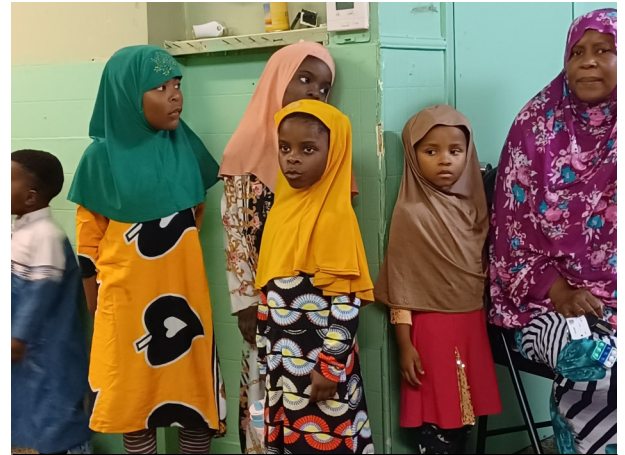
Children waiting to greet us

single line and went around our small circle greeting each of us individually, using both