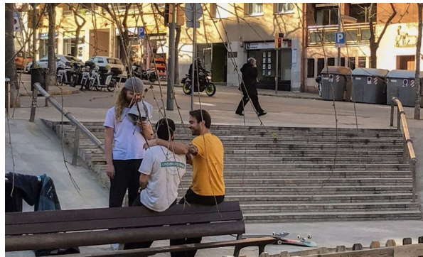
Some of the guys I’ll be doing skate ministry with for the upcoming years!

you? He sure does with me. Knowing that skate supplies are pricey here, I brought my old beat-up board and a new spare from the States. I figured I’d use my old one until I couldn’t anymore, and then switch it with the new when I absolutely had to. Walking into my room one day, there was a barely used skate-deck laying on my bed in very good